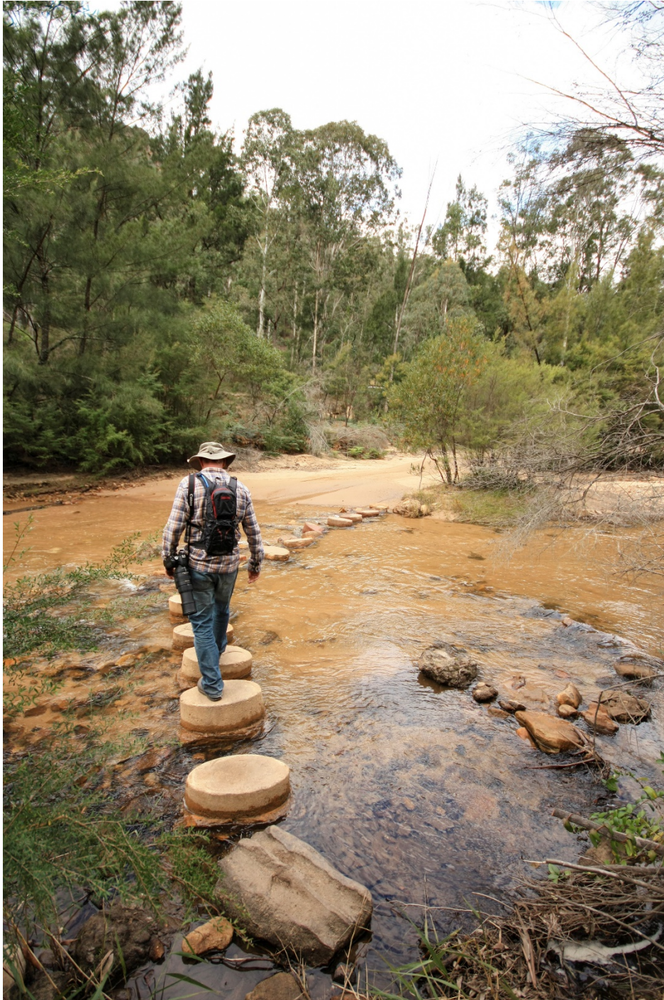
Photo 1 Wolgan River crossing, Wollemi National Park.

The Wollemi Great Walk map provides an overview of the complete visitor experience, with individual sections detailed below.