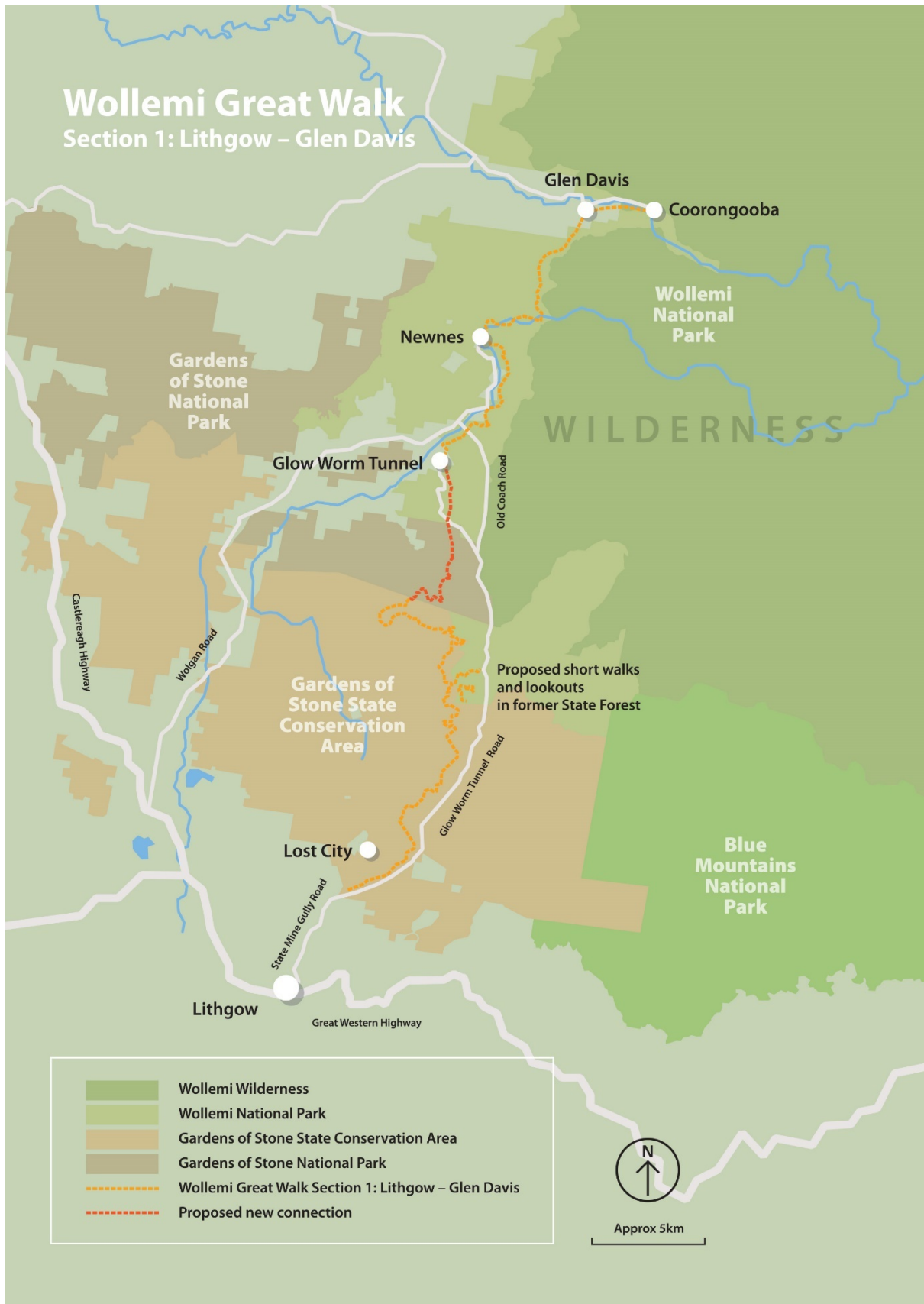
Figure 2 Wollemi Great Walk. Section 1: Lithgow to Glen Davis