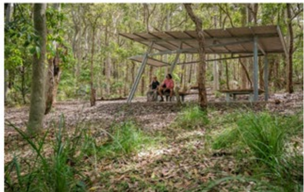
Figure 3 Similar infrastructure to proposed remote campsites on the Wollemi Great Walk

Top left – Acacia Flat campground, Blue Mountains National Park.