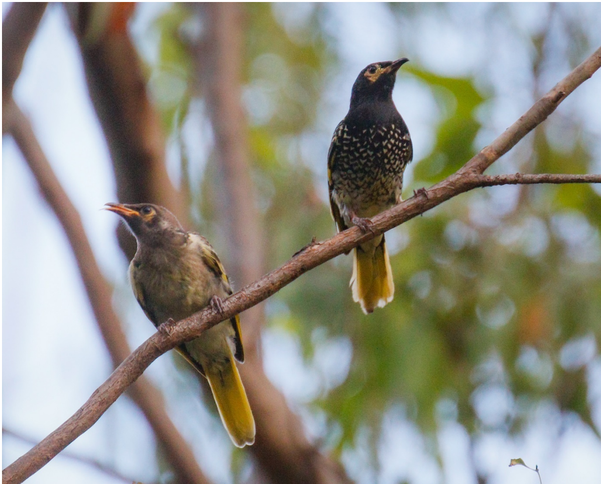
Photo 4 Regent honeyeater ( Anthochaera phrygia ), Widden Valley.