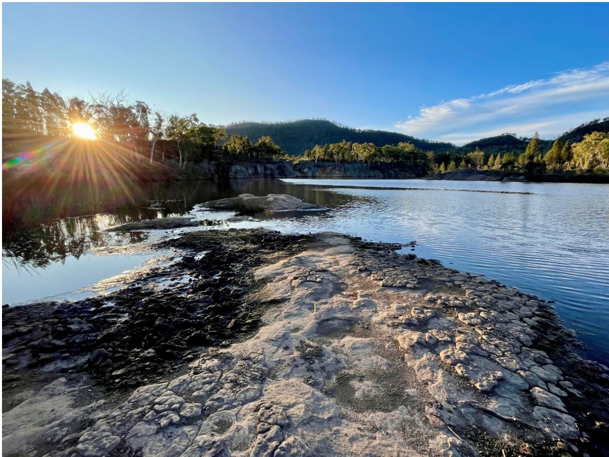
Photo 3 Ganguddy-Dunns Swamp.