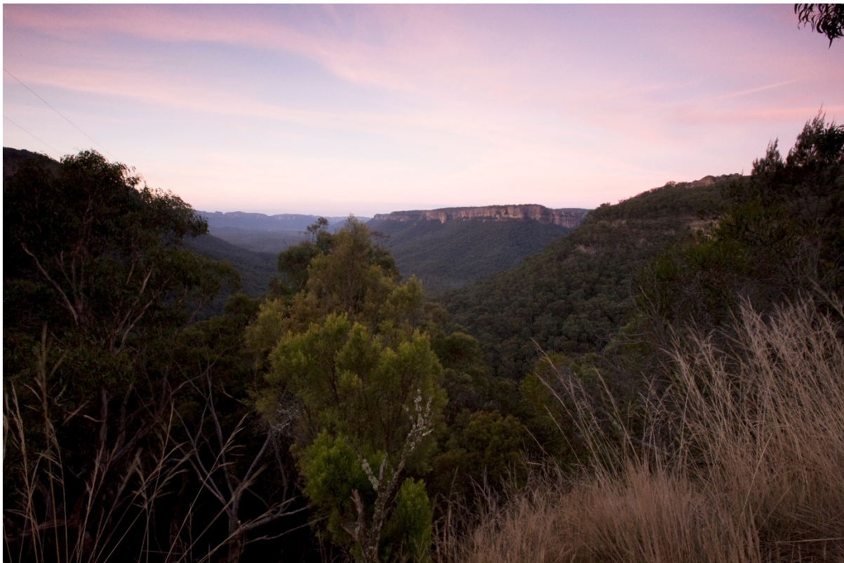
Photo 2 Newnes Plateau.