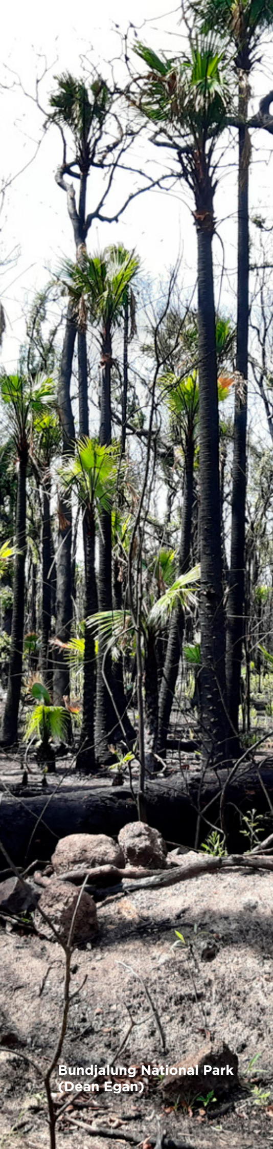
Bundjalung National Park (Dean Egan)