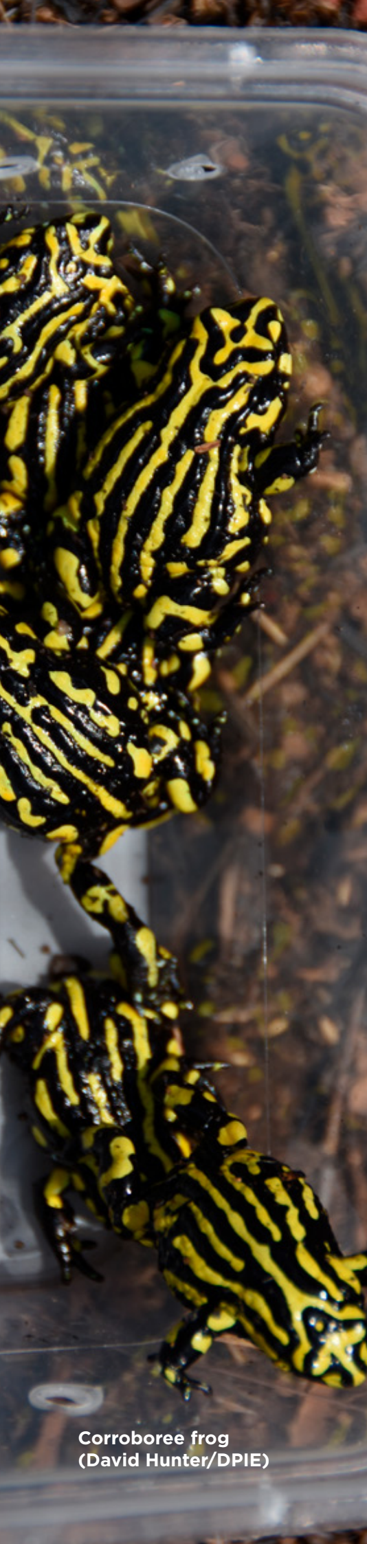
Corroboree frog