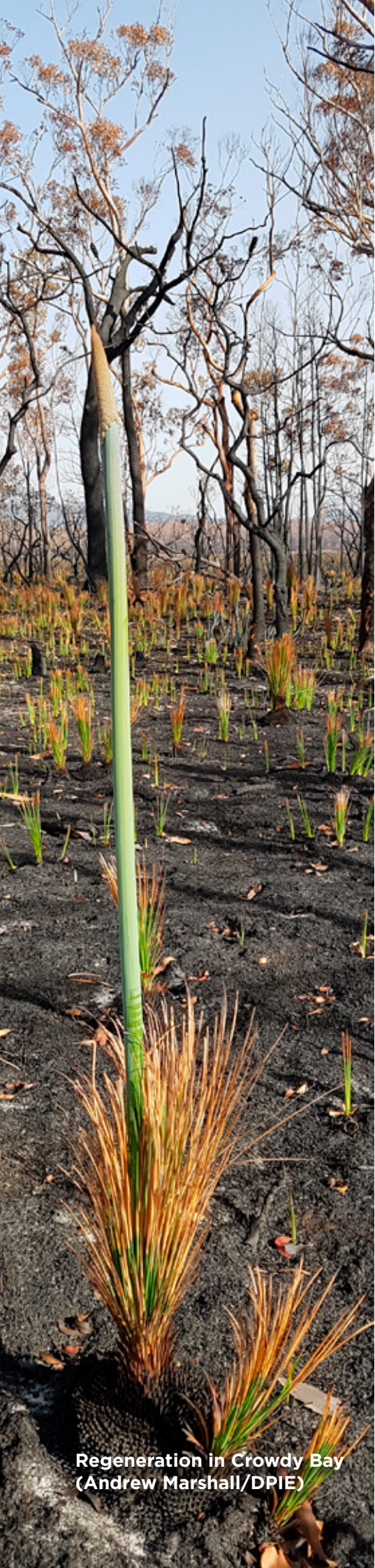
Regeneration in Crowdy Bay