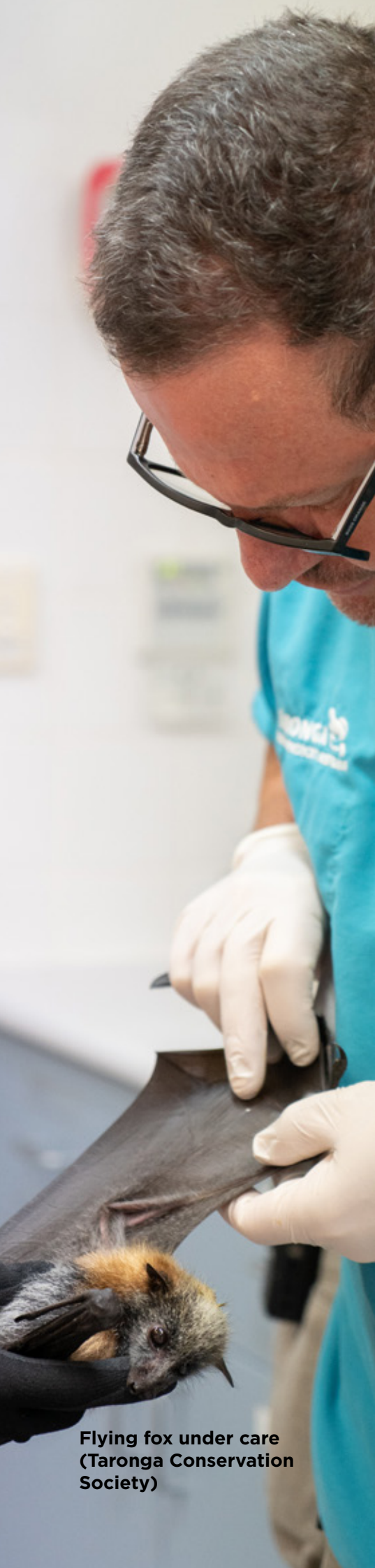
Flying fox under care (Taronga Conservation Society)