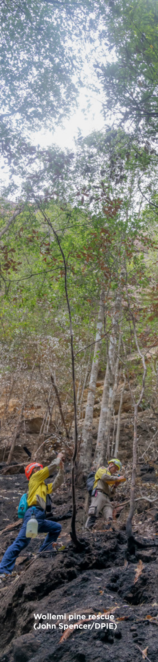
Wollemi pine rescue